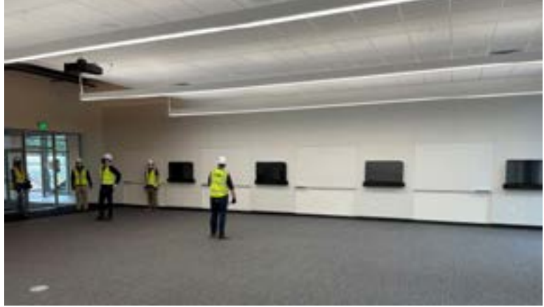
Active Learning Classroom