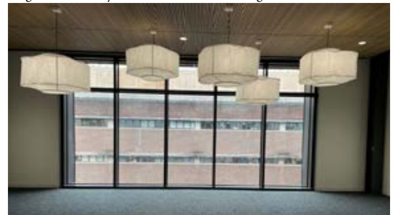
IPE Student Lounge - 3rd Floor