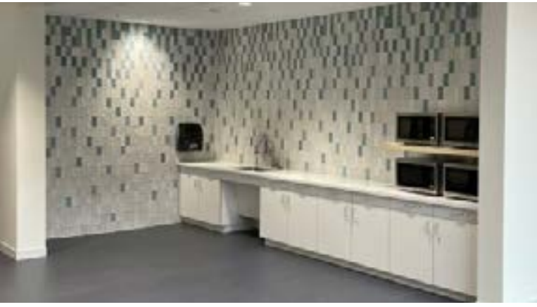
IPE Kitchen - 3rd Floor