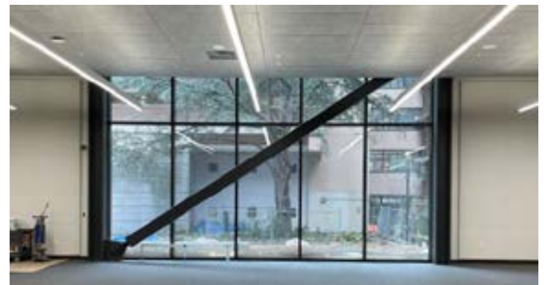
Large Classroom by the Front Entrance Looking Towards HSC