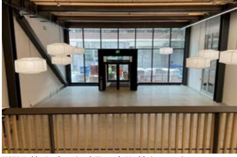
HSEB Lobby Looking South Towards Health Sciences Center