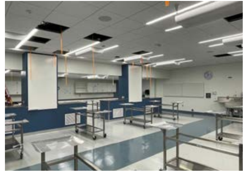
Gross Anatomy Suite