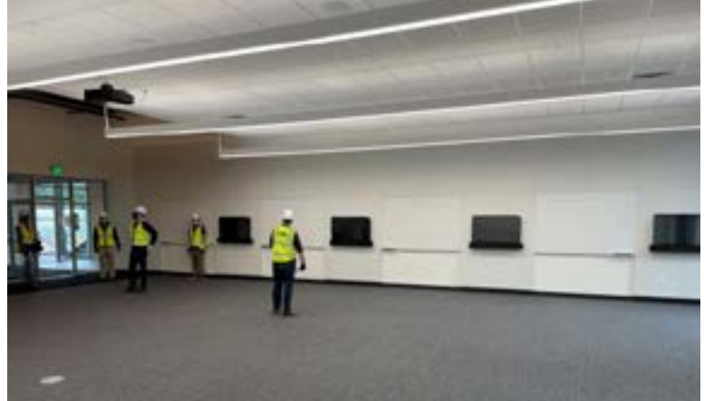
Active Learning Classroom