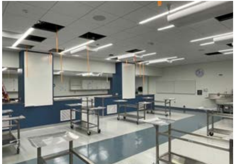
Gross Anatomy Suite