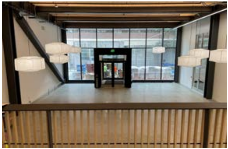
HSEB Lobby Looking South Towards Health Sciences Center