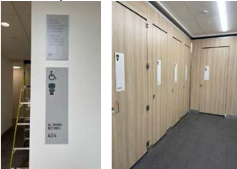
All Gender Restrooms - located on each floor with common wash area