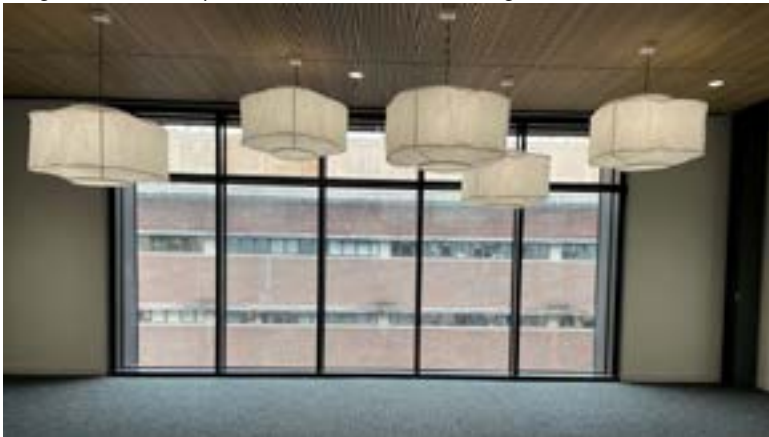
IPE Student Lounge - 3rd Floor