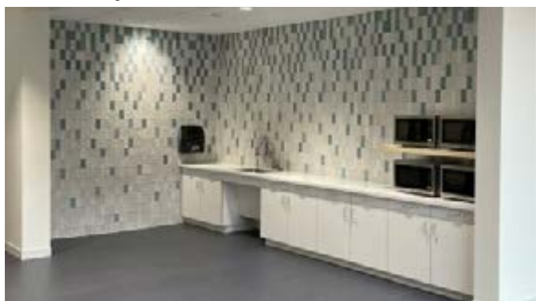
IPE Kitchen - 3rd Floor