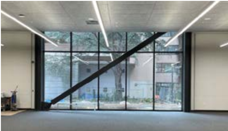
Large Classroom by the Front Entrance Looking Towards HSC